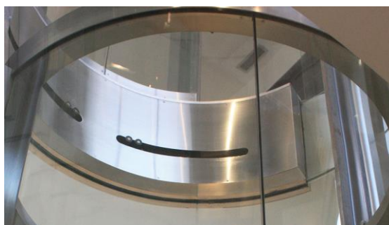
Round hall door tracks with cover