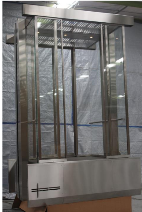
Under platform under door operator assembly in our factory