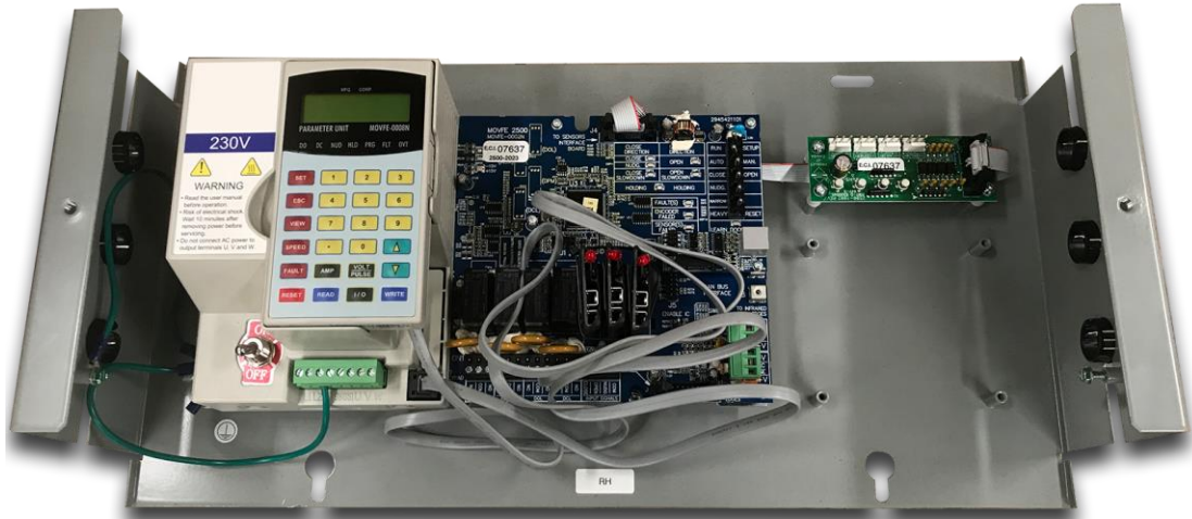
Door Control Board with Handheld Control Unit