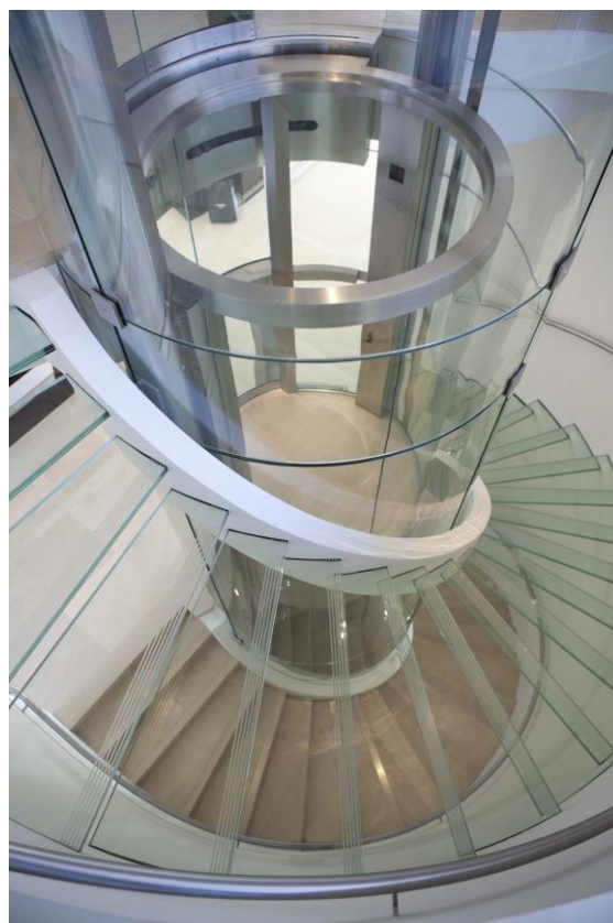
Round under door operator in job site