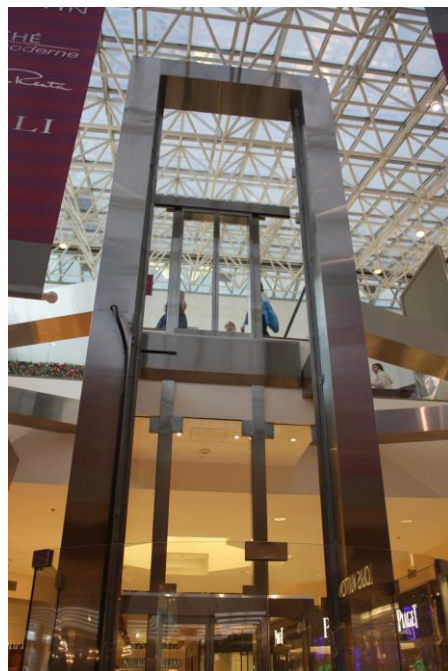
Under platform hall door operator assembly on job site