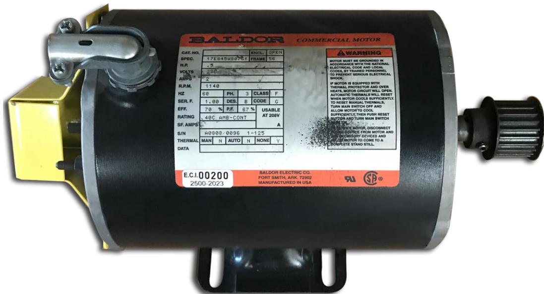
1/2 H.P. Motor