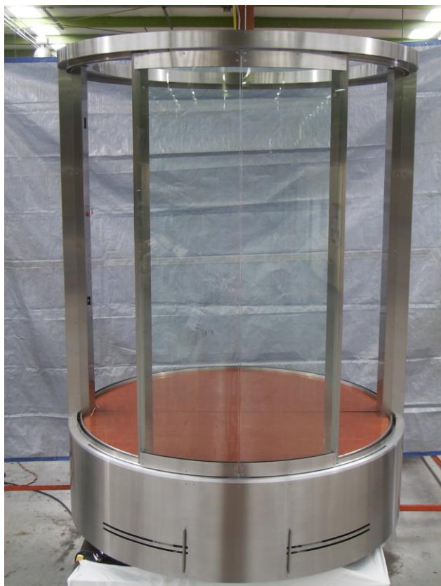
Round under platform door operator in shop

We utilize a (½) horsepower linear door operator with a programmable board that has a handheld device for programming and adjustment. This can be accomplished by using the handheld controller and programming the doors from the hallway.